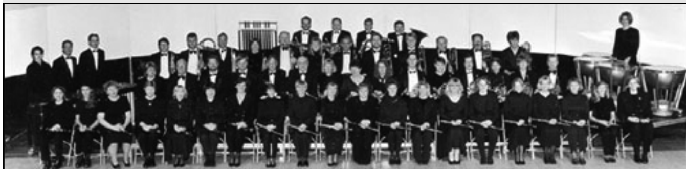
Medalist Concert Band