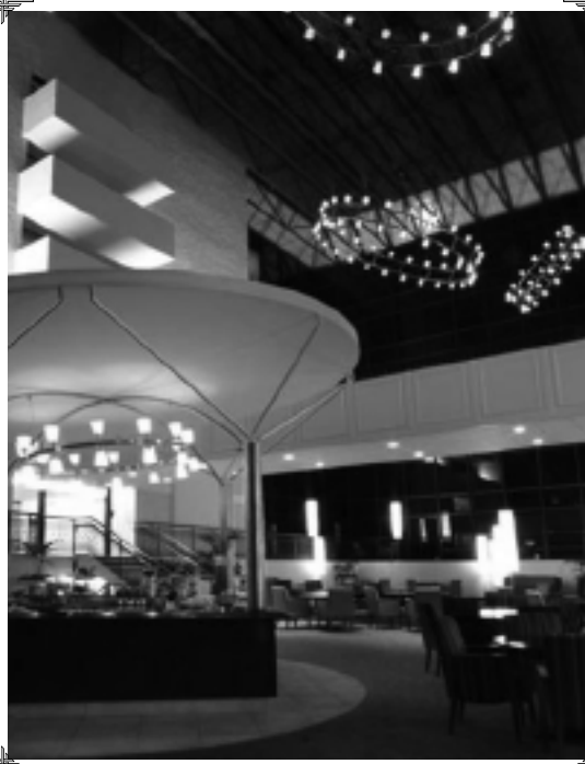
Members attending the 2006 Fall Session will stay at the beautiful Sofitel Hotel.