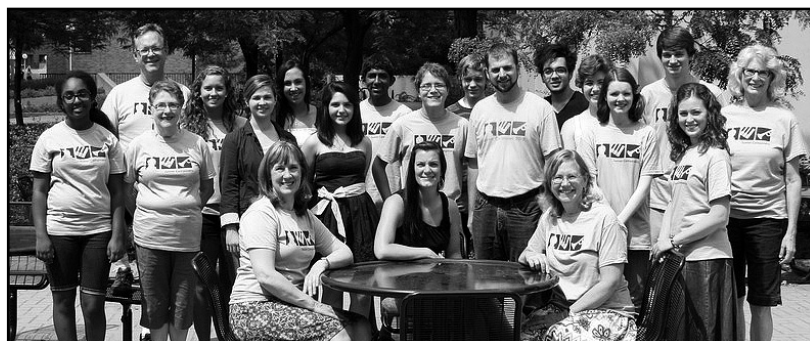
Junior Composers from Minnesota who participated in JC summer camp 2012